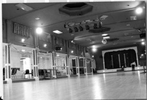
Trafalgar Ballroom - 1950's sunken ballroom