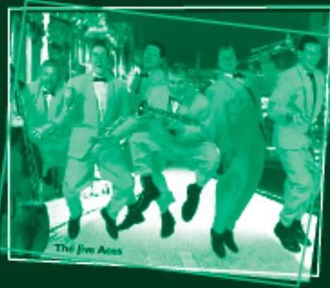
The Jive Aces