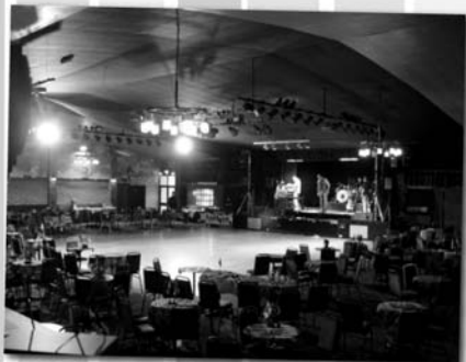
The Nelson Ballroom