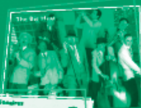
The Big Heat